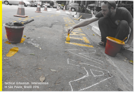
Tactical Urbanism - Intervention in São Paulo, Brazil 2016

I am looking for new challenges and have a creative and idealistic desire to transform cities on a global scale while designing in the local scale.